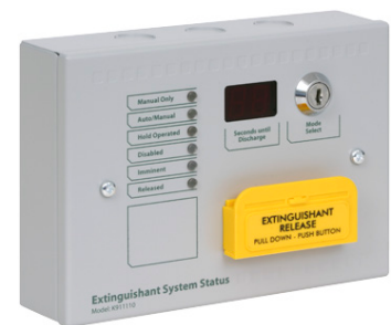
Model No. K91111M8