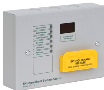
Model No. K91101M8