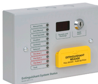
Model No. K91113M8