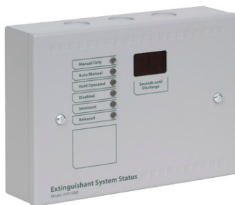
Model No. K91100M8

Sigma XT panels are both robust and easy to install having all the electronics mounted on a single, easily removable, steel plate.