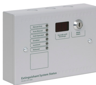
Model No. K91110M8