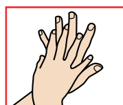
Back of hands