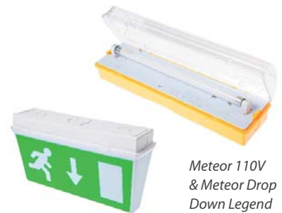
Meteor 110V & Meteor Drop Down Legend