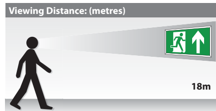
Please note image shown is not to scale and is for pictorial reference only