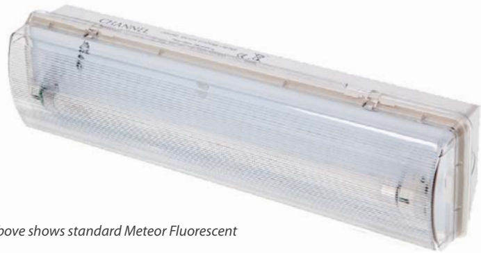
Image above shows standard Meteor Fluorescent