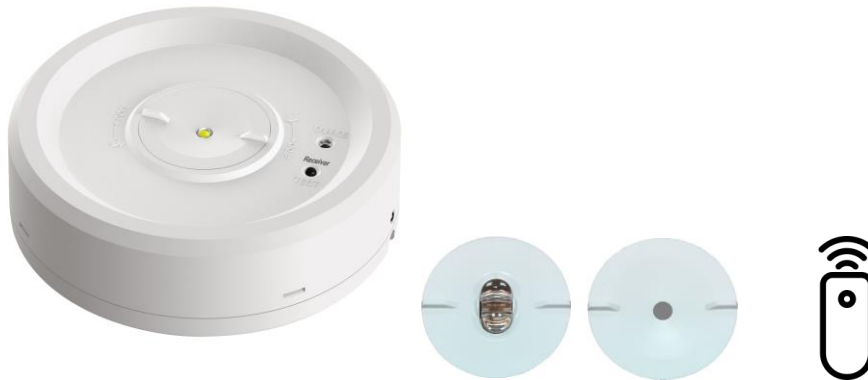
Supplied with two lens options & remote-control testing option